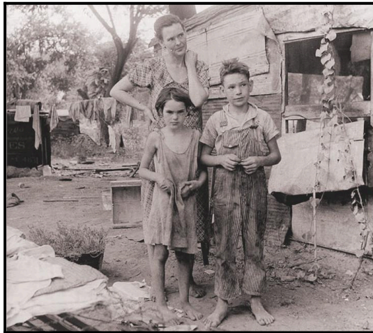
Woman and her children living in a beat-up shack during the Great Depression