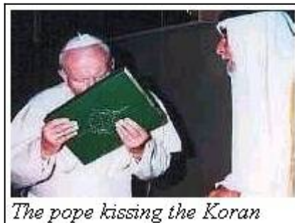
The pope kissing the Koran