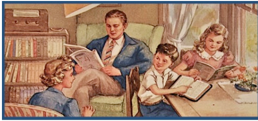
THE BIBLICAL FAMILY

Articles about marriage, courtship, home schooling and parenting.