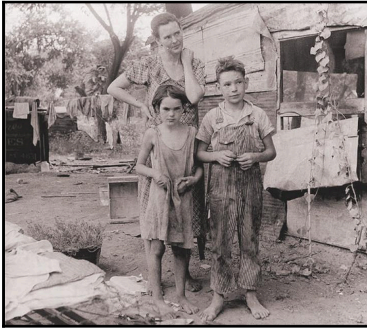
Woman and her children living in a beat-up shack during the Great Depression