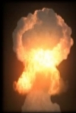
a BIG explosion

Evolutionists believe that in the course of a VERY VERY long time , an explosion they call "the big bang" created everything we see.