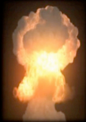
a BIG explosion

Please note that this last analogy is VERY significant, because it points out where evolution BEGINS as well as where it ENDS . People who argue about various so-called midpoints on the make-believe evolution timeline should instead concentrate on the TWO ENDPPOINTS of evolution and see who is willing to BELIEVE THAT STORY WITHOUT LAUGHING!