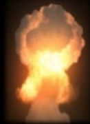
a BIG explosion

Please note that this last analogy is VERY significant, because it points out where evolution BEGINS as well as where it ENDS. People who argue about various so-called midpoints on the make-believe evolution timeline should instead concentrate on the TWO ENDPOINTS of evolution and see who is willing to BELIEVE THAT STORY WITHOUT LAUGHING!