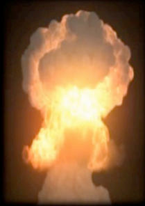
a BIG explosion

Evolutionists believe that in the course of a VERY VERY long time , an explosion they call “the big bang” created everything we see.