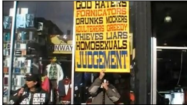
Preaching Outside A Catholic Church

Videos of street preachers in the United States proclaiming the Gospel to passersby in various downtown areas, mostly on the east cost of the U.S.